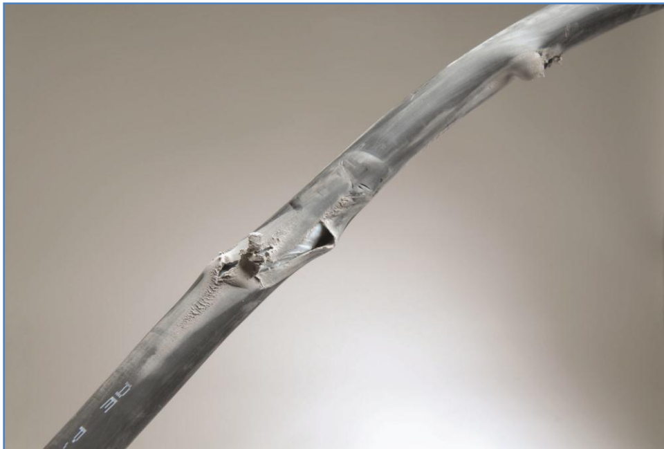
Figure 2. Heat-shrink tubing can be used to repair worn and damaged wire and cable.

Tubing is typically made by forming a tube and exposing it to intense radiation (irradiated), during which it is expanded to a larger size. The expanded tubing is what you buy. The expanded tubing has “memory,” so that when it is heated it will return to its original state.