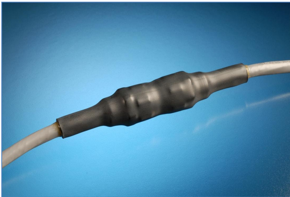
Figure 3. Heat-shrink tubing can be easily applied to irregular surfaces

Apply heat evenly, often moving the heat gun from one end of the tube to the other works well. You should also apply heat in a full 360° around the tubing. This may not always be possible, but cover as much of the tubing with heat as possible.